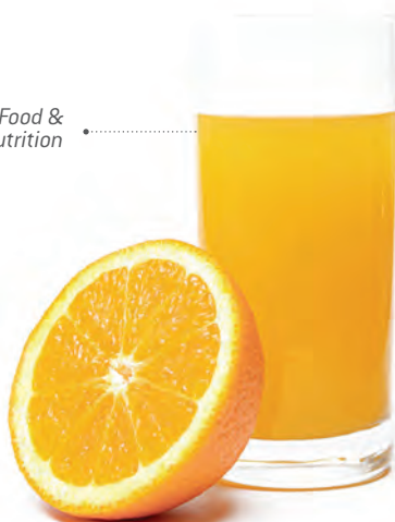
Food & nutrition