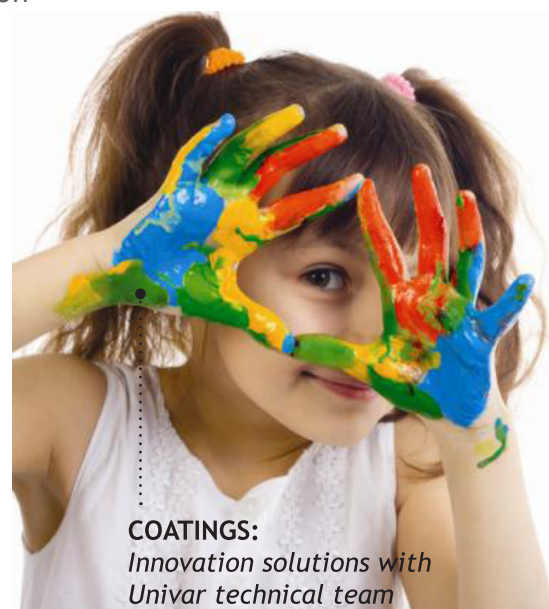
COATINGS: Innovation solutions with Univar technical team

XZ 95330.00 is designed primarily for use in civil engineering and marine and protective coatings. Applications include high gloss finishing coat, decorative and protective coatings for food factories, schools, hospitals and office buildings, and coatings for warm climates.